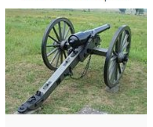
10-Pounder Parrott Rifle