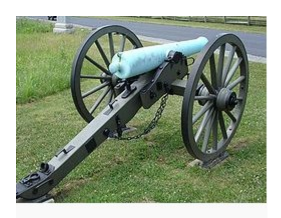
M1857 12-Pounder "Napoleon"