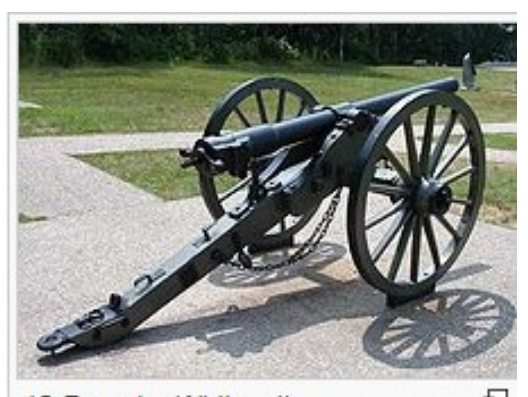
12-Pounder Whitworth Breechloading Rifle.