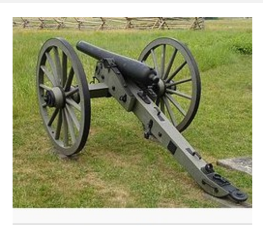
3-Inch Ordnance Rifle (rear view)