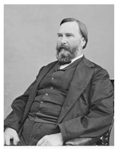
James Longstreet after the War