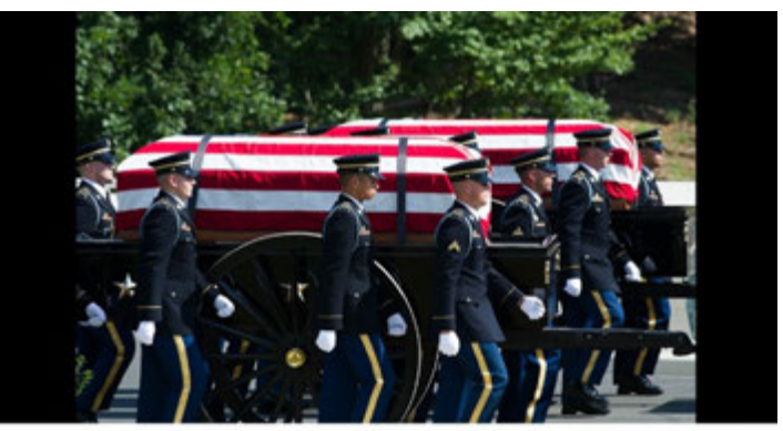
The 3rd Infantry Regiment Calsson Platoon carry the remains of two unknown Civil War Union soldiers to their grave at Artington National Cemetery in Artington, Va., Thursday, Sept. 6, 2018.

The decision was made at the time that two complete sets of remains would be buried at Arlington. They could not be identified, but from the location of the pit, it was decided that they were Union soldiers who died at the Second Battle of Bull Run in 1862.