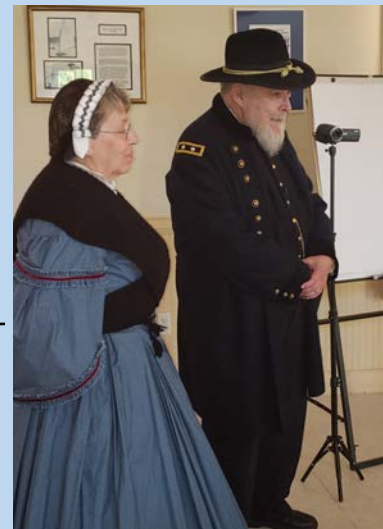
General and Mrs. Greene

To all that attended the April meeting and experienced the visit of General and Mrs. George Sears Greene, we thank you for your support. Without your attendance and dues support our Civil War Round Table we would cease to exist. We