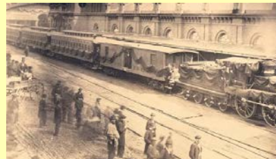
Lincoln Funeral Train

...May 10 Jefferson Davis is captured near Irwinville, Georgia