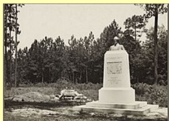
Capture site Monument

While he was wearing a raincoat, rumor had it that he was wearing a woman's dress. This was probably not true.